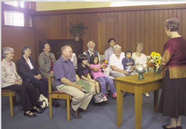
BRADFORD UNITARIAN CENTRE