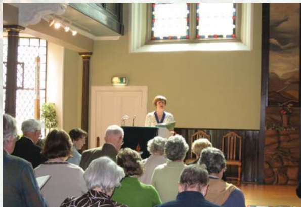
ST MARK'S UNITARIAN CHURCH, EDINBURGH

Unitarians enjoy listening to the opinions of others, so let someone know your impressions after the service! The minister or leader, or church members would be pleased to answer any questions you might have.