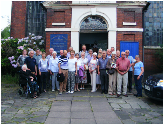
Kinver Historical Society outside the Chapel